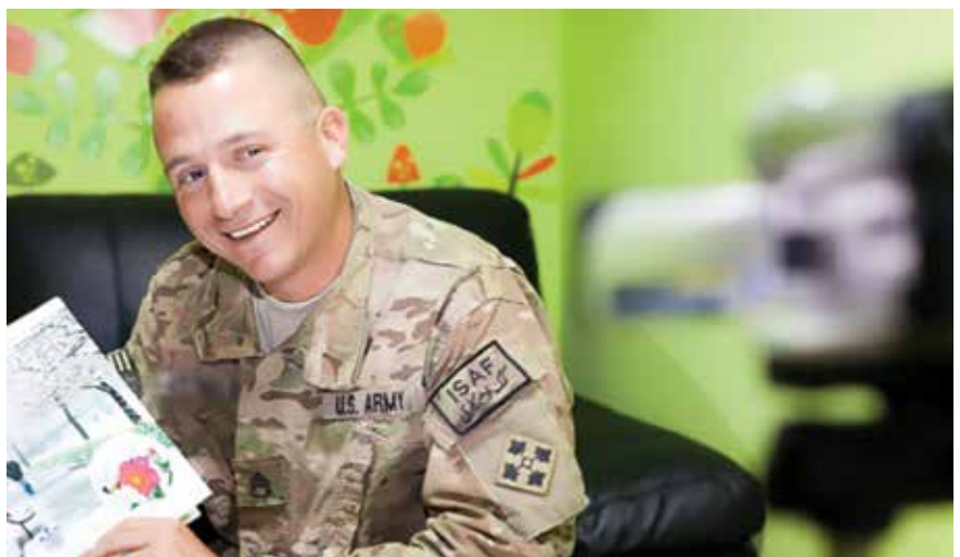
A service member recording a bedtime story from the UTR recording location at USO Bagram.