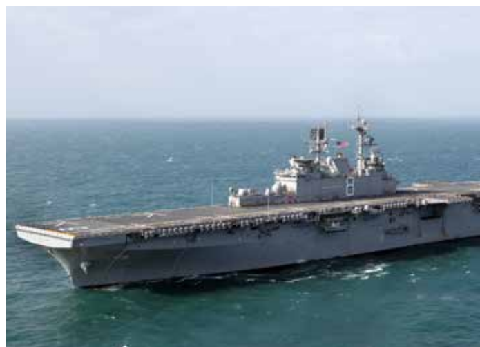
The USS Makin Island (LHD-8)