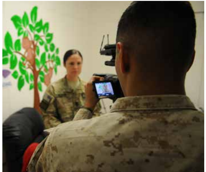
In 2015, military families stayed connected from more than 260 United Through Reading locations worldwide.